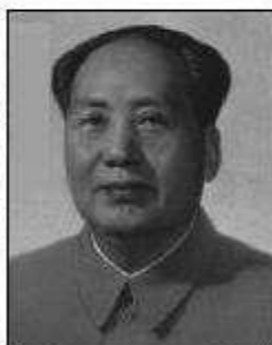
Mao Tse-tung 毛沢東