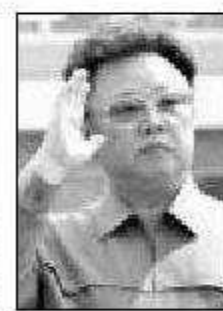
Kim Jong-il 金正日